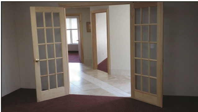
Suite A - lower level