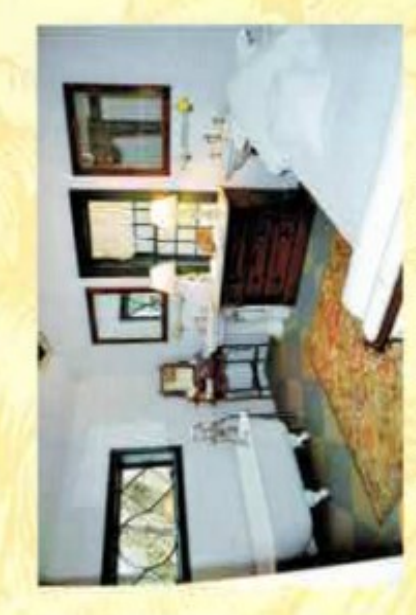
The Locaritant She Impered Bathroom

Sign away and calm your mind, body and spirit in our beautifully appointed spa-inspired bath complete with antique barbrub, full shower, and a wonderful chaise lounge. This area is large enough to accommodate your wedding party, as you may want to have your makeup and hair professionals join you here, using this romantic background for some of your treasured photographs.