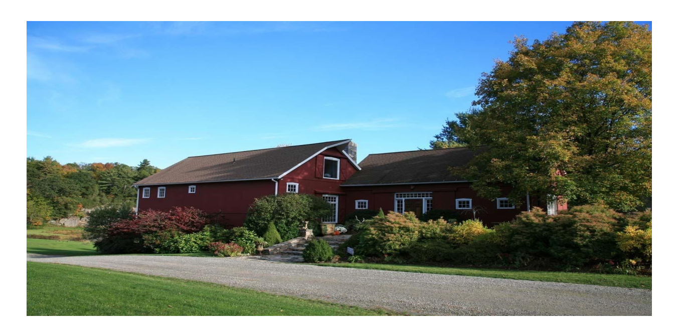
3 Story Barn/ Loft/Silo Building with Wine Cellar 7,192 S/F Gross leasable area 1,256 S/F Basement Finish Destination location

Current Use: Events and Weddings, Country Loft Antiques, Design Studio Originally Built in the 1840's - Professionally Renovated in 1996