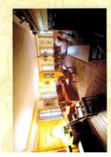
The Inviting Firefide Keipling Reads

The Country Loft B&B is situated in the neart of Woodbury, the "Antiques Capital of Connecticut." We are the perfect location for walking, jogging, biking, biking, fishing, and of course, antiquing, in one of the many intrique thops that line our quaint Main Street. The B&B, dating back to 1706, was originally the borne of Samuel Bull, the first blacksmith in the town of Woodburt. All rooms are custom designed in gloricus, rich fabrics, beautiful tranquil colors, and wonderful authentic antiques. Upon urriving, enter mo a true 18th century home, filled with tradition and old world charm.