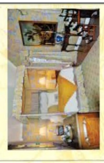
The Protestial Leilow Saudianies Matter Boltown

For more information and/or reservations, Please Email us at countryloftbandb@yahoo.com or call 203-266-4500