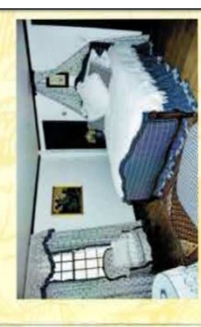
The Bline Hydeingest Guest Bedresow