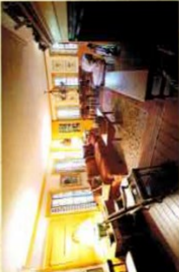
The Inviting Firrside Keeping Room

The Country Loft B&B is situated in the heart of Woodbury, the "Antiques Capital of Connecticut." We are the perfect location for walking, jogging, biking, hiking, fishing, and of course, antiques, in one of the many antique shops that line our quaint Main Street. The B&B, dating back to 1706, was originally the home of Samuel Bull, the first blacksmith in the town of Woodbury. All rooms are custom designed in glorious, rich fabrics, beautiful tranquil colors, and wonderful authentic antiques. Upon arriving, enter into a true 18th century home, filled with tradition and old world charm.