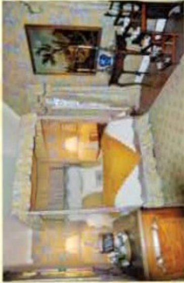
The Prerential Yellow Sunflower Master Bedroom