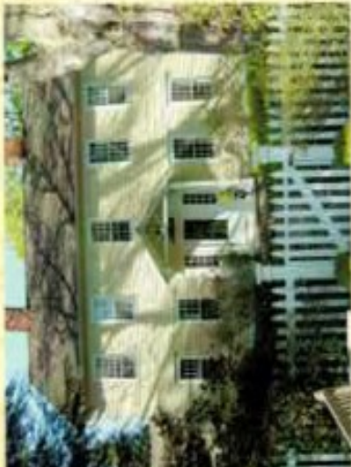
The Country Loft B & B