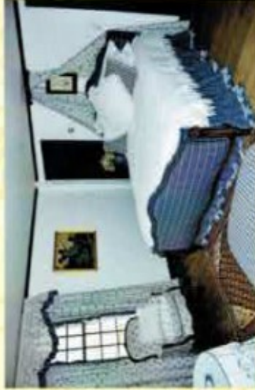
The Blue Hydrangea Guest Bedroom