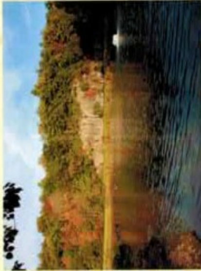
The Historic Majestic Stone Quarry and Pond