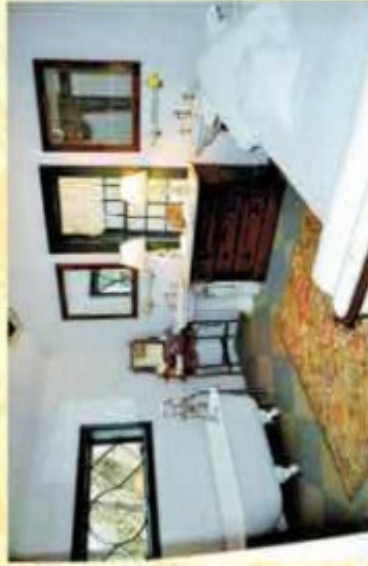
The Luxurious Spa Inspired Bathroom

Slip away and calm your mind, body and spirit in our beautifully appointed spa-inspired bath complete with antique bathtub, full shower, and a wonderful chaise lounge. This area is large enough to accommodate your wedding party, as you may want to have your makeup and hair professionals join you here, using this romantic background for some of your treasured photographs.