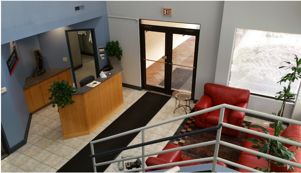
1 St Floor Lobby