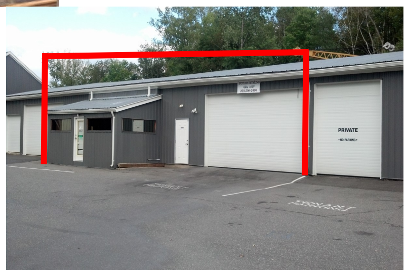
Suite # 2 Office & Drive - in Door