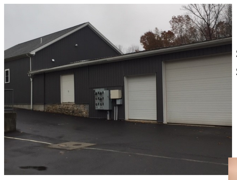
Suite #1 Side View