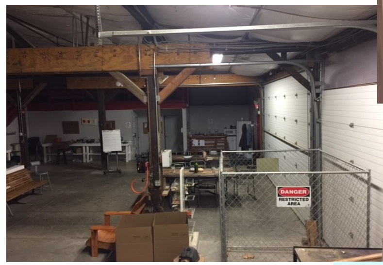
Suite #1 Shop Area