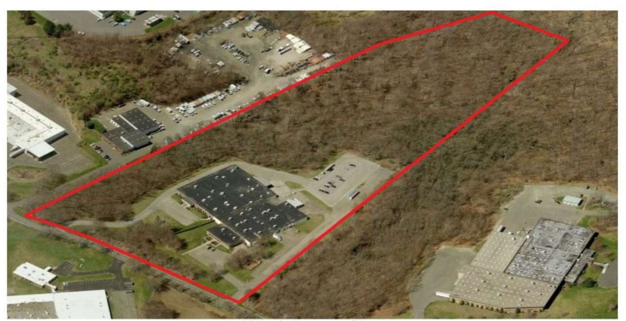
Aerial view, looking west (per Bing.com).