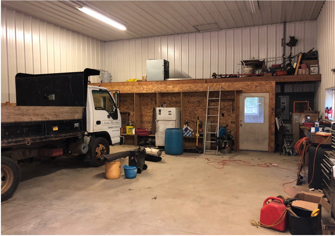
Former Tree Service Facility Large Yard for Outdoor Storage