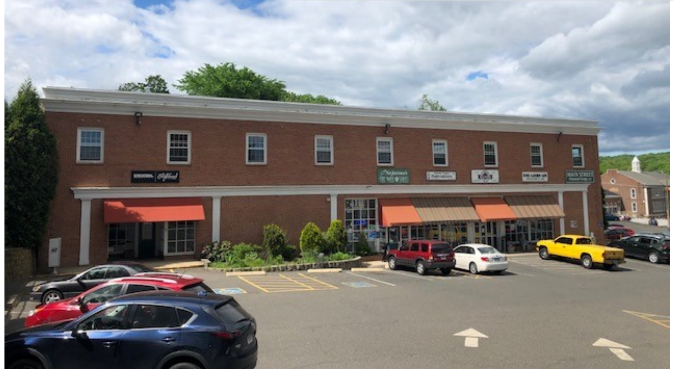
All information furnished is from sources deemed reliable and is submitted subject to errors, omissions, change of other terms of conditions, prior sale, lease or financing or withdrawal-all without notice. No representation is made or implied by Godin Property Brokers, LLC or its associates as to the accuracy of the information submitted herein.

Location Location Busy Main Street Restaurant With Patio & Office Spaces Available