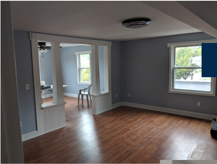
Apartments Rubber Ave, Naugatuck