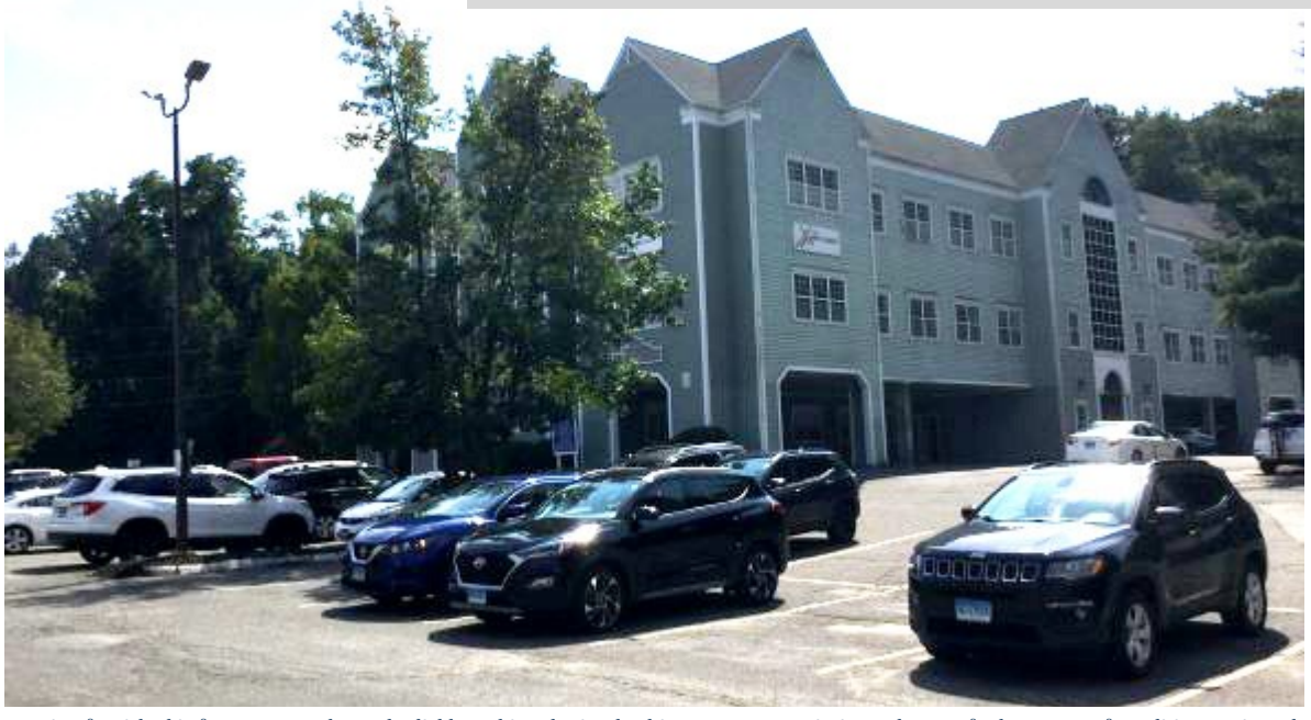
All information furnished is from sources deemed reliable and is submitted subject to errors, omissions, change of other terms of conditions, prior sale, lease or financing or withdrawal-all without notice. No representation is made or implied by Godin Property Brokers, LLC or its associates as to the accuracy of the information submitted herein.

Private Professional Office Suites With Individual Offices Plus Waiting Area Multiple Suites Available Lease Rate: Suites From $600 Per Month All Utilities Included