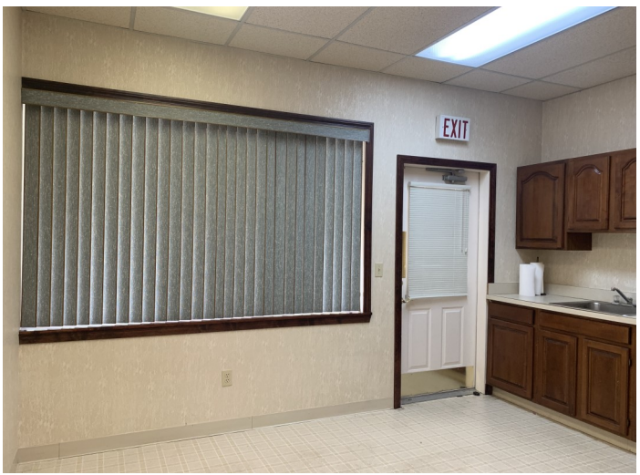
Suite 5: 1,740 S/F Offers: Large Open Area plus 2 Large Offices, Kitchenette and 2 Restrooms Asking: $1,300 Monthly + Utilities & Percentage of Snow Removal