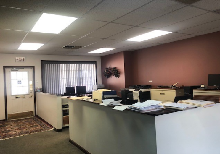
Suite 6-7: 2,700 Combined +/- S/F Possible to Subdivide

Offers: Large Reception & Waiting Area, Conference Room & 4 Oversized Offices Asking: $2,000 Monthly + Utilities & Percentage of Snow Removal