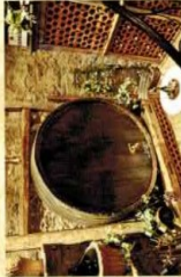
Custome Designed 17th Century Wine Cask