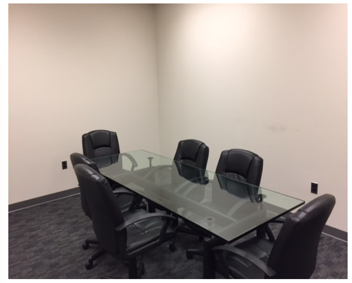
Shared Conference Room