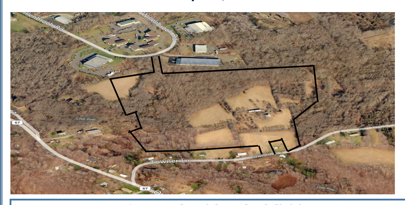
41 +/- Acre Industrial Land Subdivision

New business park/road entering from Willenbrock Road Industrial lot sizes from 5 acres and up All utilities are available in pro-business community with low tax rate. Great location. Access to I-84 (+/- 2.5 miles) and Route 8 (+/- 5 miles) Cleared and ready to go pad sites New airport enterprise zone.