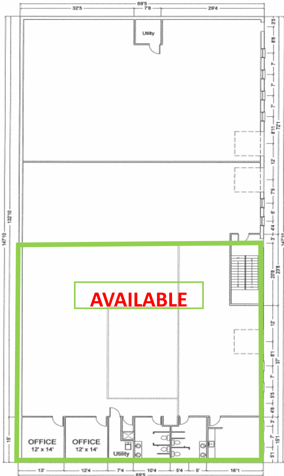
Building 3/ Lower Level