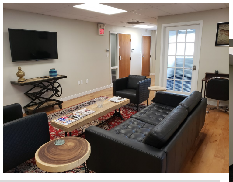
Executive Suites Includes: Utilities - Shared Conference Room - WIFI From $400.00 Mo.