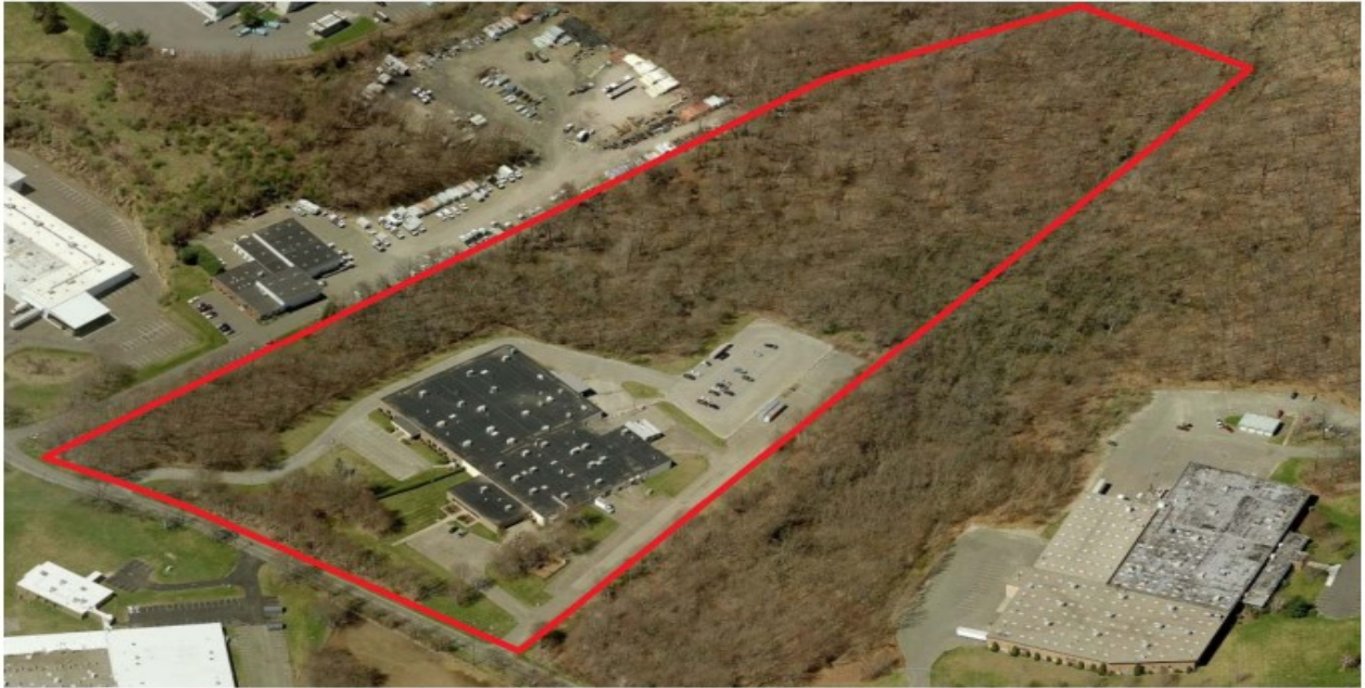
Aerial view, looking west (per Bing.com).