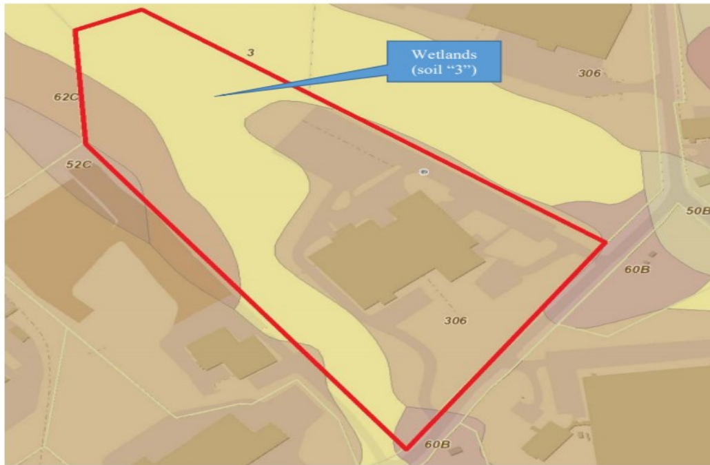
GIS Map - ↑N With soils overlay