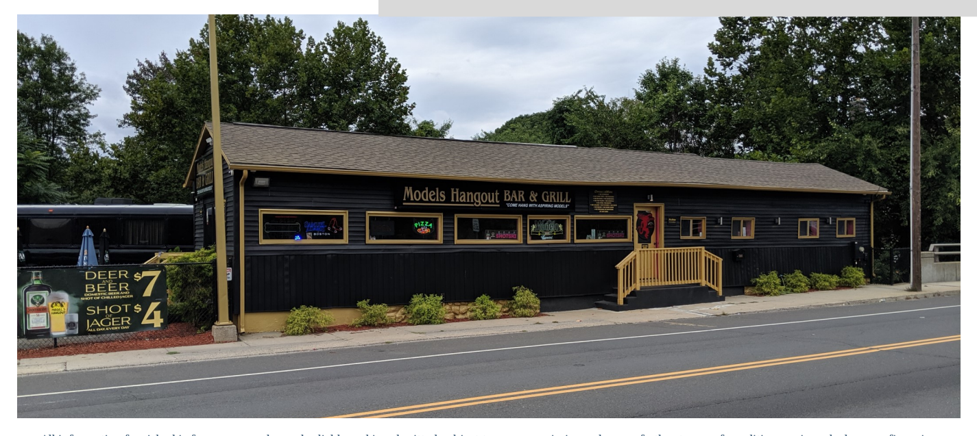
All information furnished is from sources deemed reliable and is submitted subject to errors, omissions, change of other terms of conditions, prior sale, lease or financing or withdrawal-all without notice. No representation is made or implied by Godin Property Brokers, LLC or its associates as to the accuracy of the information submitted herein.