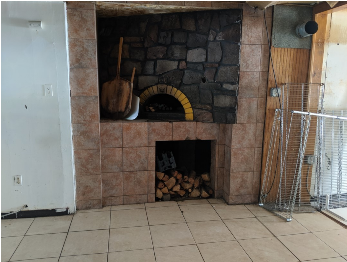
Restaurant has Hood, Walk-in , Sink & Brick Oven