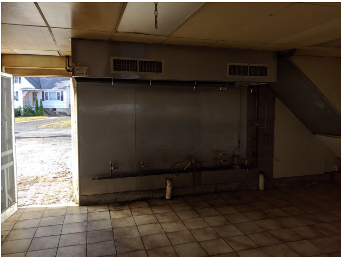
Retail/ Office 600 S/F