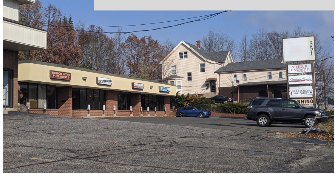
All information furnished is from sources deemed reliable and is submitted subject to errors, omissions, change of other terms of conditions, prior sale, lease or financing or withdrawal-all without notice. No representation is made or implied by Godin Property Brokers, LLC or its associates as to the accuracy of the information submitted herein.

Retail Plaza with Two Spaces Available Each 1,800 S/F +/Perfect for All Retail or Commercial Office Uses Including a Fully Functional Tanning Salon High Traffic Location with Parking in Front and Rear $14 PSF Gross + utilities