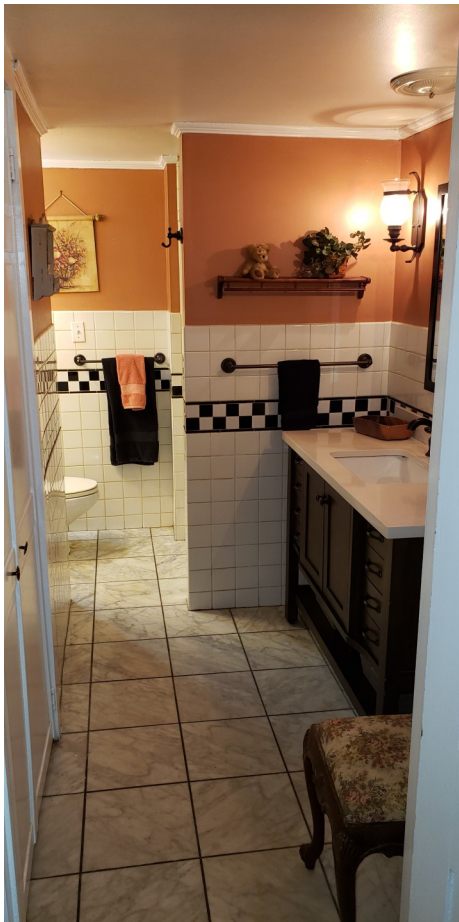
1582 Straits Turnpike Middlebury