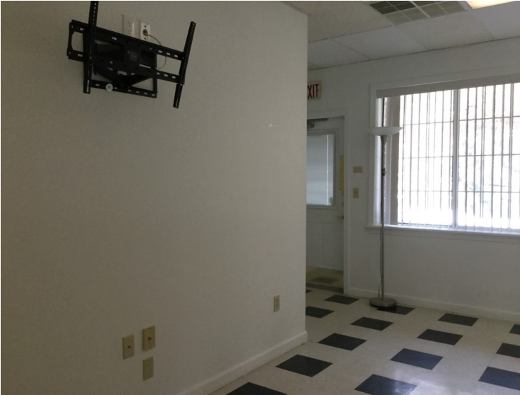
Suite 9: 1,100 +/- S/F Offers Large Waiting / Reception Area With 3 Offices Lease Rate: $1,200 per mo. + + Snow Removal Percentage