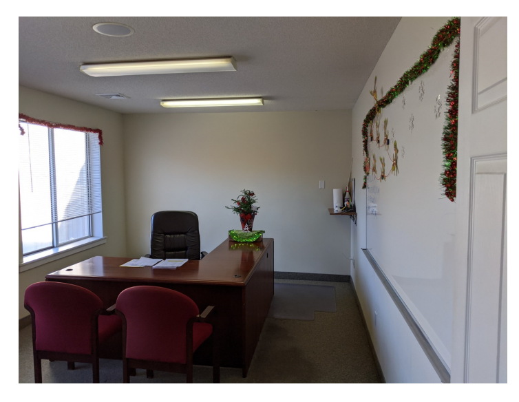
Perfect for Attorney, CPA, Therapist or other Professional User