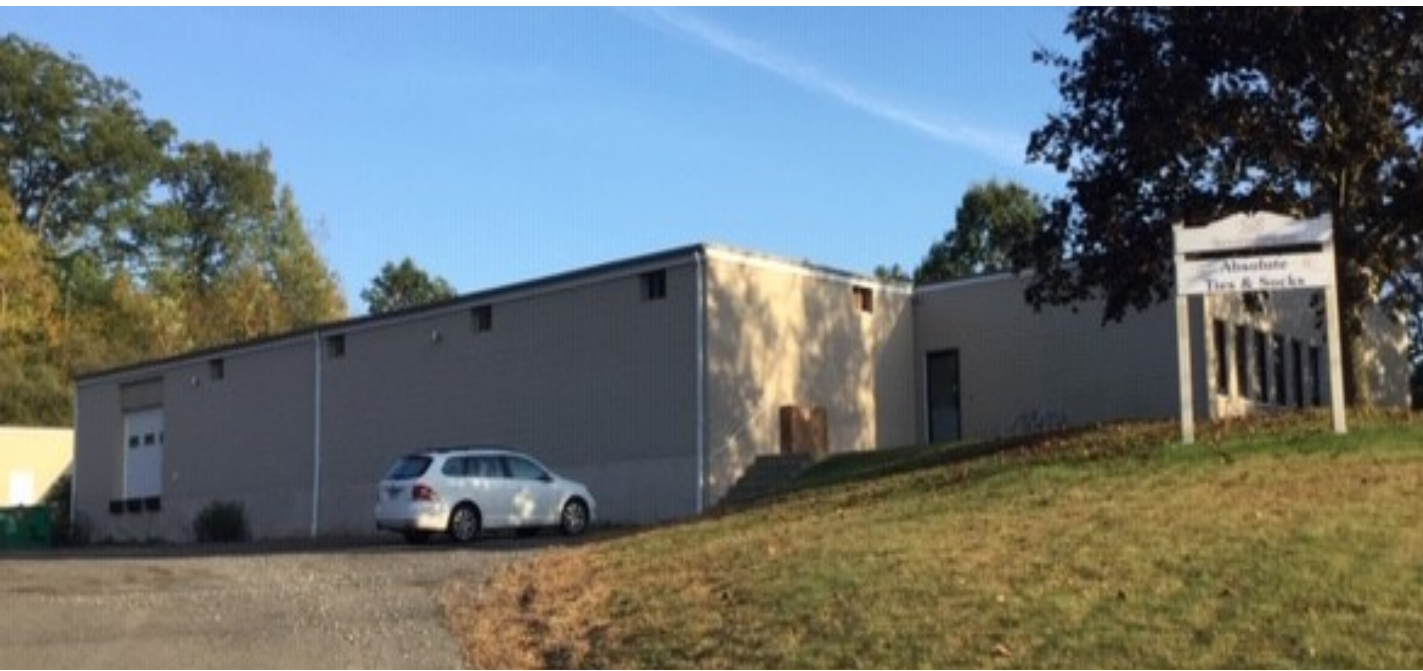
25 Gramar Ave Unit A, Prospect, CT 06712