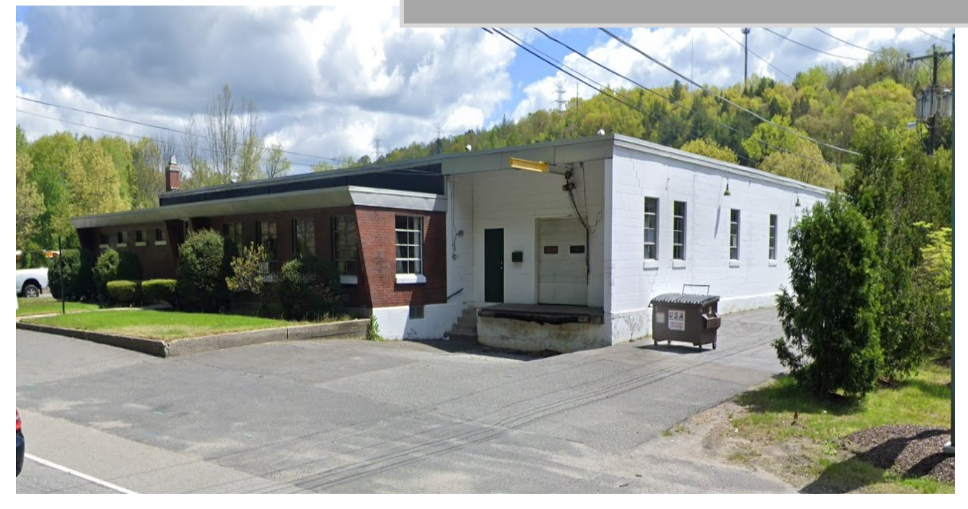
All information furnished is from sources deemed reliable and is submitted subject to errors, omissions, change of other terms of conditions, prior sale, lease or financing or withdrawal-all without notice. No representation is made or implied by Godin Property Brokers, LLC or its associates as to the accuracy of the information submitted herein.

Suite C: 1,260 S/F Shop Space- Open Space Visible Location with Easy RTE 8 Access Lease Price: $9 PSF + Utilities