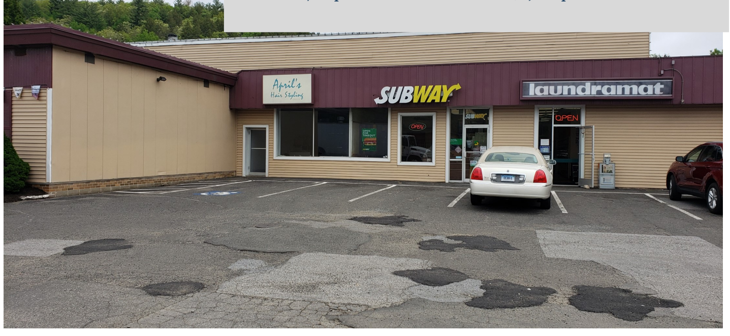
All information furnished is from sources deemed reliable and is submitted subject to errors, omissions, change of other terms of conditions, prior sale, lease or financing or withdrawal-all without notice. No representation is made or implied by Godin Property Brokers, LLC or its associates as to the accuracy of the information submitted herein.

2,700 S/F Space: Currently Set Up As Office $2,900 per mo. + utilities 900 S/F Space: Pervious Hair Salon $1,200 per mo. + utilities