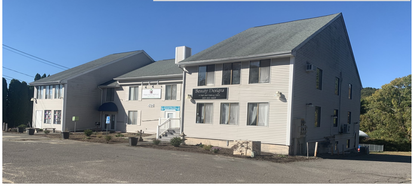
All information furnished is from sources deemed reliable and is submitted subject to errors, omissions, change of other terms of conditions, prior sale, lease or financing or withdrawal-all without notice. No representation is made or implied by Godin Property Brokers, LLC or its associates as to the accuracy of the information submitted herein.

3 Suites Available Beautiful...Remodeled, Bright & Clean Ideal for Professional & Retail Uses Units From: $600.00 Per Mo. + Utilities