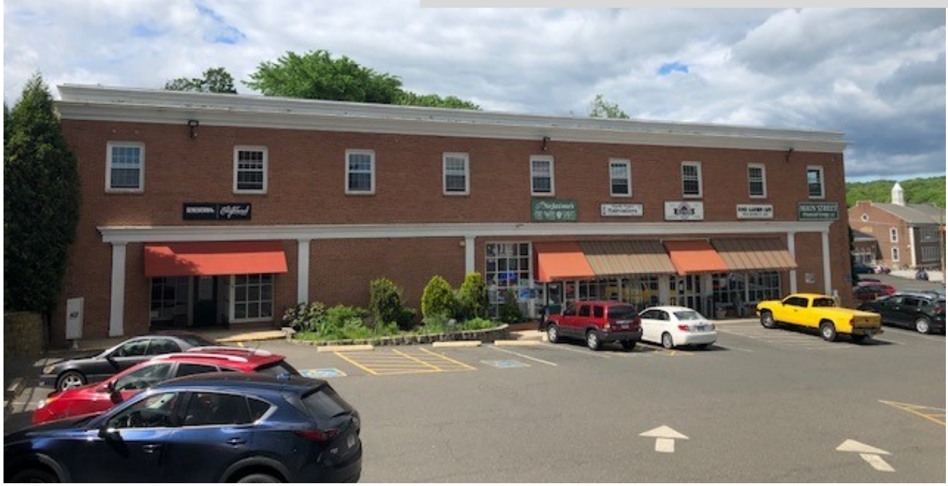
All information furnished is from sources deemed reliable and is submitted subject to errors, omissions, change of other terms of conditions, prior sale, lease or financing or withdrawal-all without notice. No representation is made or implied by Godin Property Brokers, LLC or its associates as to the accuracy of the information submitted herein.