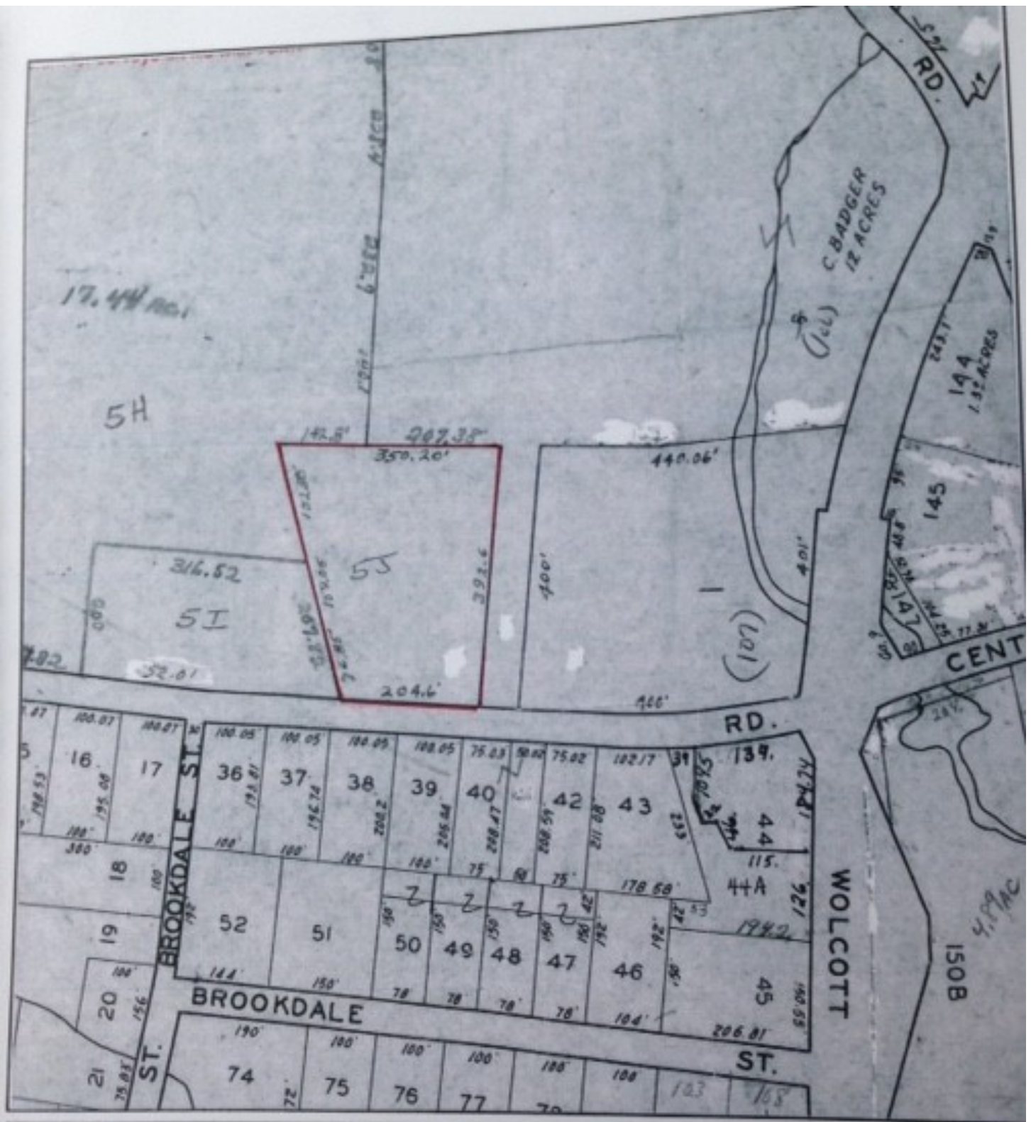
FIGURE 3: WOLCOTT, CT ASSESSOR'S MAP