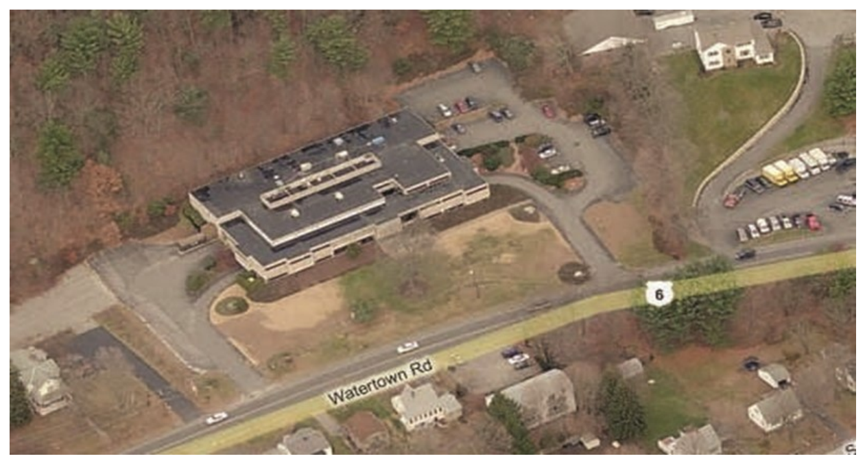
Newly designed 2015