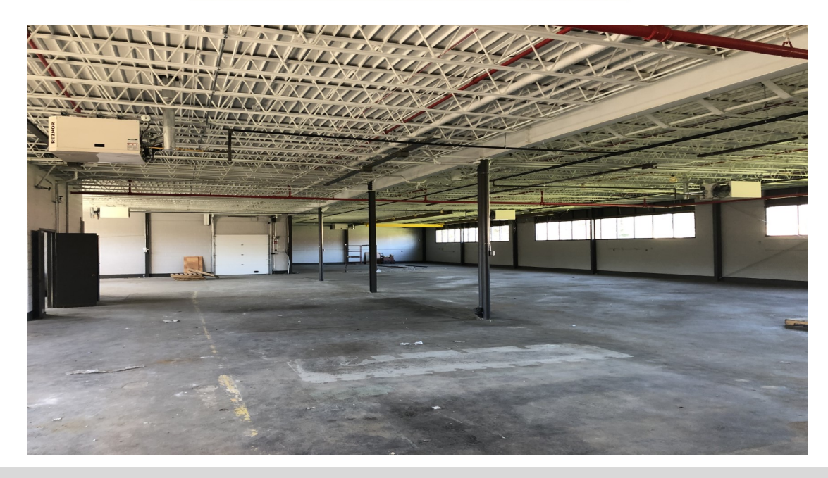
2 Available Docks 1 with Load Leveler Also 1 UPS Height Dock Renovations Underway will Include Office Area, Restrooms, Office Roof, Masonry Repairs, Exterior Lighting and Exterior Shop Windows Replaced