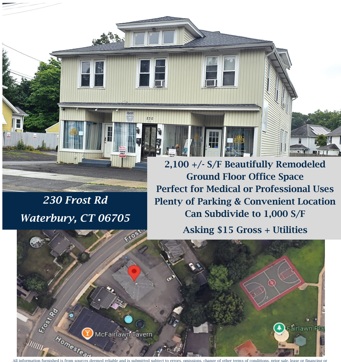
All information furnished is from sources deemed reliable and is submitted subject to errors, omissions, change of other terms of conditions, prior sale, lease or financing or withdrawal-all without notice. No representation is made or implied by Godin Property Brokers, LLC or its associates as to the accuracy of the information submitted herein.