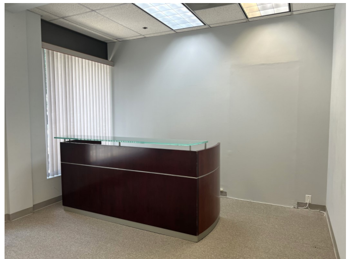
Suite A $700.00/mo