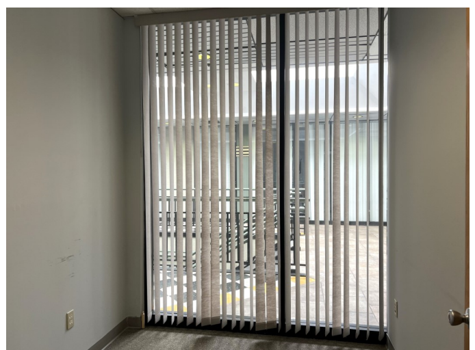
Suite E $500.00/mo