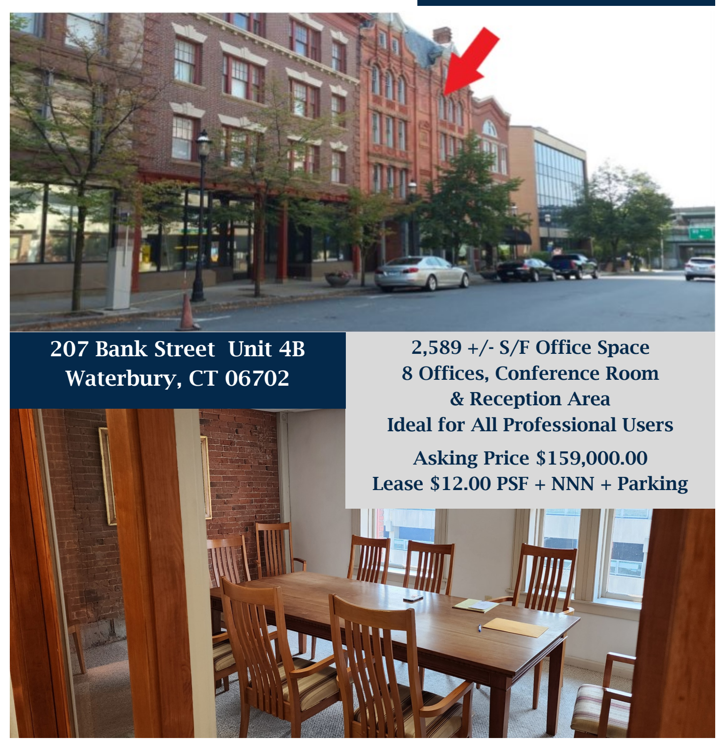
All information furnished is from sources deemed reliable and is submitted subject to errors, omissions, change of other terms of conditions, prior sale, lease or financing or withdrawal-all without notice. No representation is made or implied by Godin Property Brokers, LLC or its associates as to the accuracy of the information submitted herein.