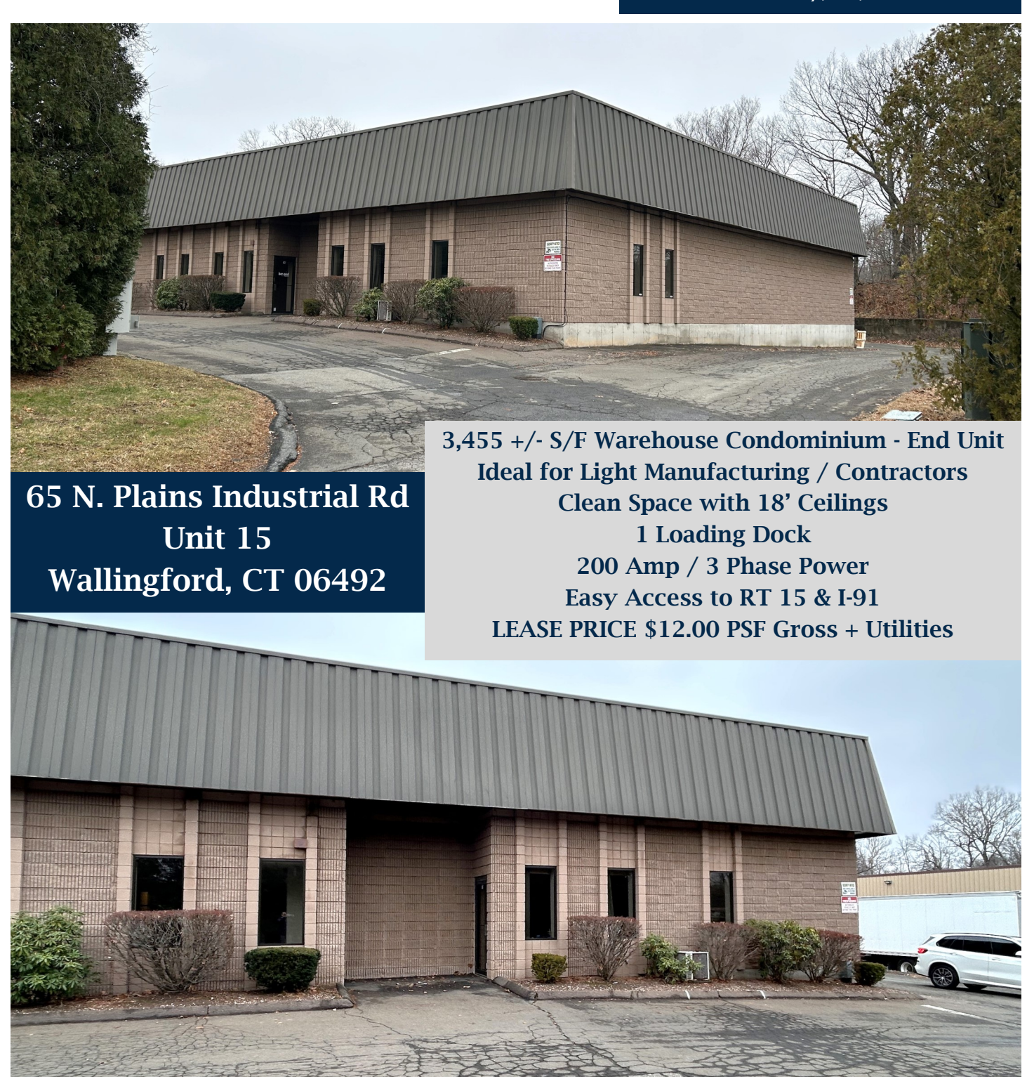
All information furnished is from sources deemed reliable and is submitted subject to errors, omissions, change of other terms of conditions, prior sale, lease or financing or withdrawal-all without notice. No representation is made or implied by Godin Property Brokers, LLC or its associates as to the accuracy of the information submitted herein.

E-mail: Bgodinpb@gmail.com E-mail: Bladrigan.gpb@gmail.com www.GodinPropertyBrokers.com Phone: 203-577-2277 Fax: 203-577-2100 850 Straits Turnpike, Suite 204 Middlebury, CT, 06762