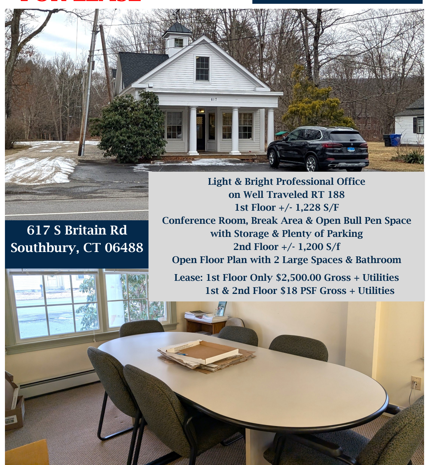
All information furnished is from sources deemed reliable and is submitted subject to errors, omissions, change of other terms of conditions, prior sale, lease or financing or withdrawal-all without notice. No representation is made or implied by Godin Property Brokers, LLC or its associates as to the accuracy of the information submitted herein.

www.GodinPropertyBrokers.com Phone: 203-577-2277 Fax: 203-577-2100