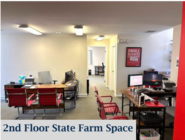
2nd Floor State Farm Space