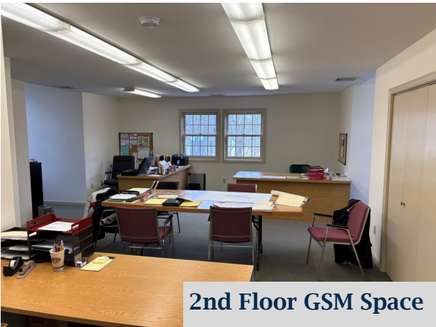
2nd Floor GSM Space