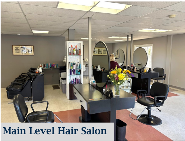
Main Level Hair Salon