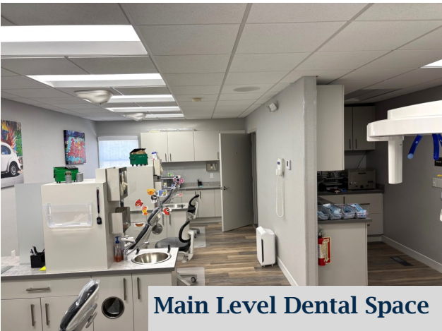
Main Level Dental Space