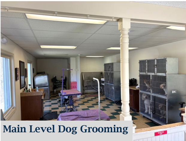
Main Level Dog Grooming