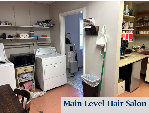
Main Level Hair Salon