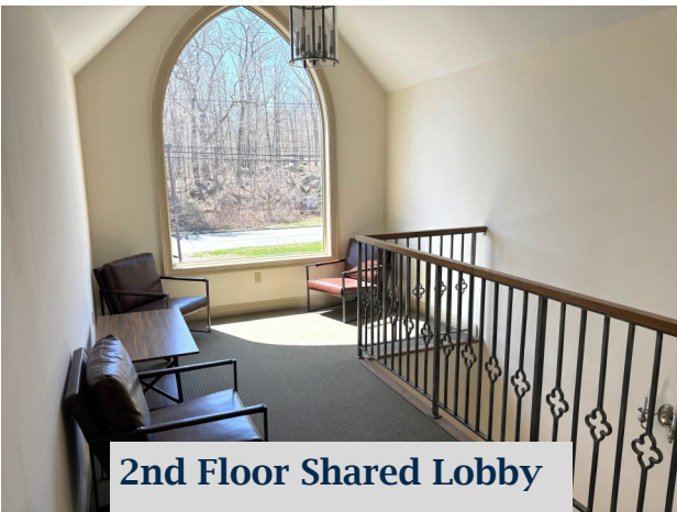
2nd Floor Shared Lobby