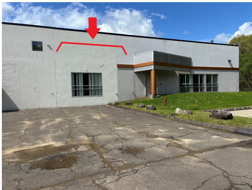
Picture Shows Area of New Dock Placement

All information furnished is from sources deemed reliable and is submitted subject to errors, omissions, change of other terms of conditions, prior sale, lease or financing or withdrawal-all without notice. No representation is made or implied by Godin Property Brokers, LLC or its associates as to the accuracy of the information submitted herein.