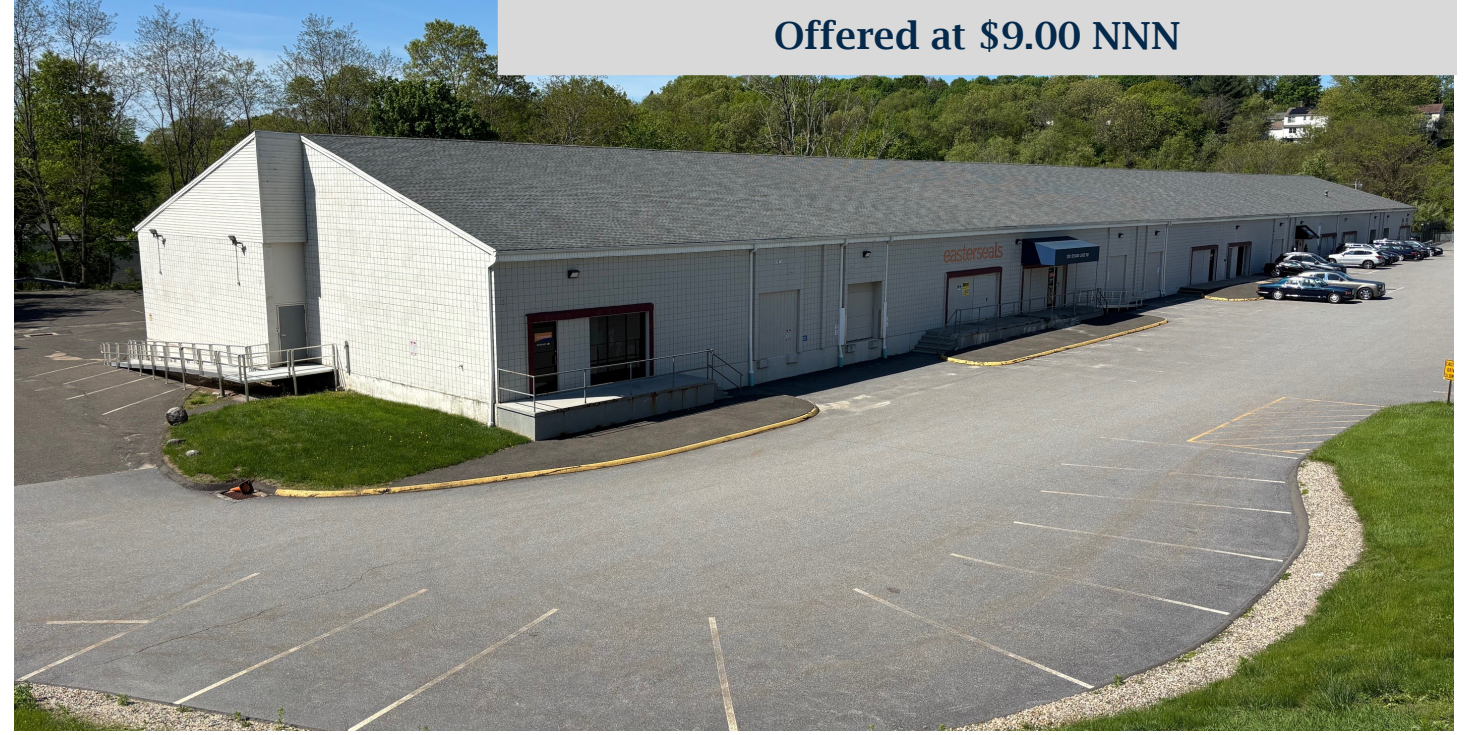
All information furnished is from sources deemed reliable and is submitted subject to errors, omissions, change of other terms of conditions, prior sale, lease or financing or withdrawal-all without notice. No representation is made or implied by Godin Property Brokers, LLC or its associates as to the accuracy of the information submitted herein.

Owner May Divide Great Location, 1 Mile from RT 8 14' Clear Height - New Dock Installed Offices will be Removed with +/- 1,000 S/F to Remain