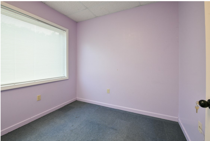
1st Floor Office